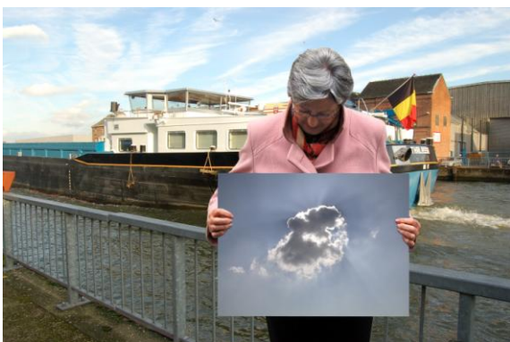
'we are traveling spaces (I)' 2009.