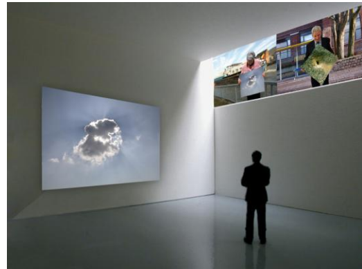
We are traveling spaces (II) 2009.